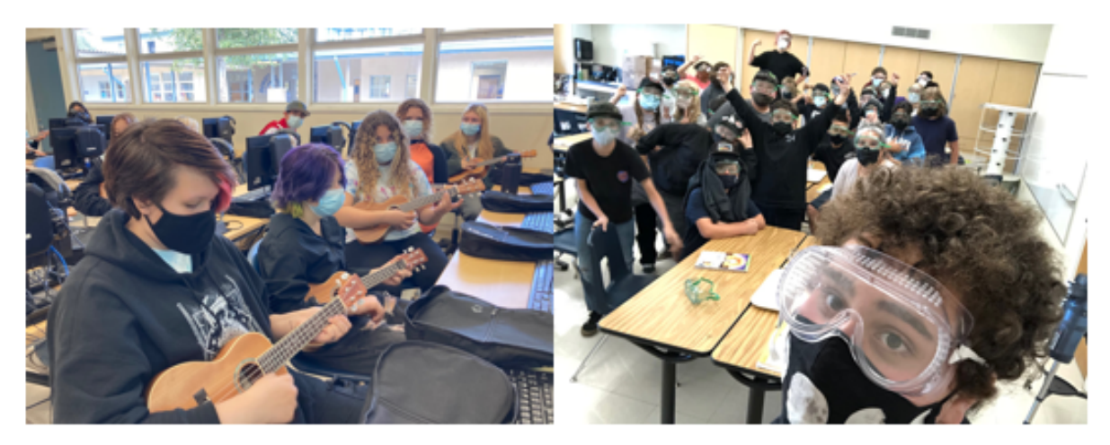
Middle School Fun learning the Ukulele and being scientists in the Science lab!

Did you know that Sunset Middle School boasts some of the highest academic achievement scores in all of the Ventura and Ojai area?! Sunset continues to have the highest attendance rate for middle school cohorts in the district, due to the fact that students just want to be here! The small school setting allows for optimum teacher to student ratio, with an increase in opportunities for all students. Sunset middle school students enjoy various field trips, clubs and visits to college campuses yearly. Sunset's 6<sup>th</sup> through 8<sup>th</sup> graders have the opportunity to show and grow their leadership skills in Student Council, with an emphasis on the importance of service. If you know of anyone who is looking into which middle school program will be their best fit, encourage them to set up a tour today!